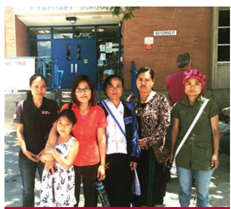
Refugee parents and one of their students at Crawford Elementary, one of Aurora's innovation schools

know something is going on, but they do not quite know what, or have a name for it," she says. The workshops then point to the critical role parents and families can play by being engaged with schools and being advocates for students beyond the classrooms by supplementing and supporting their learning at home.